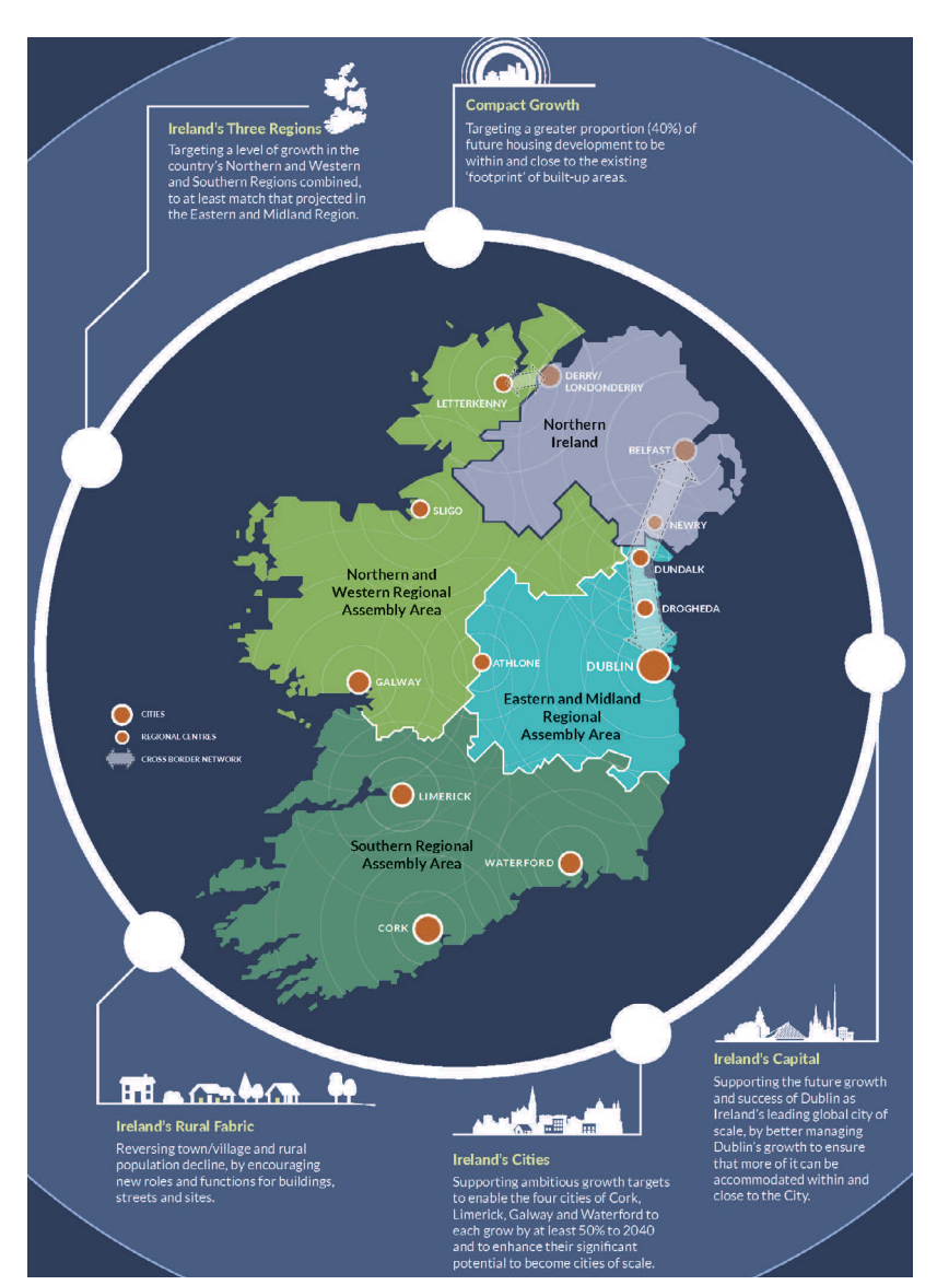
Fig. 1 The National Planning Framework recognises Sligo as a Regional Growth Centre in the Northern and Western Regional Assembly Area