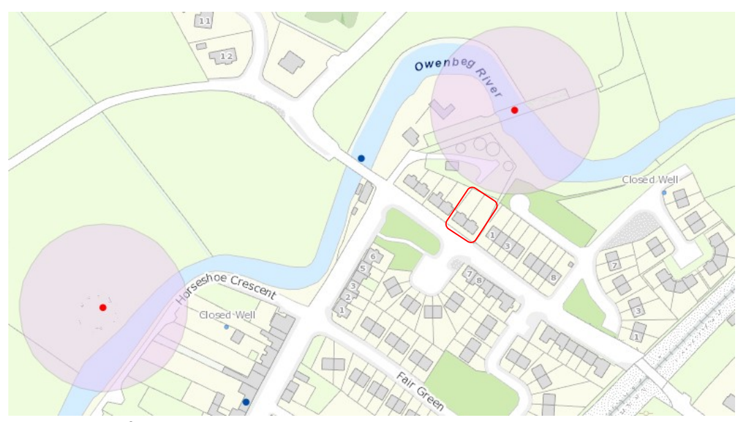
Fig 2: Extract from NIAH map

There are no registered monuments in the immediate area of the proposed site. There is no risk to protected structures or archaeology by the proposed development