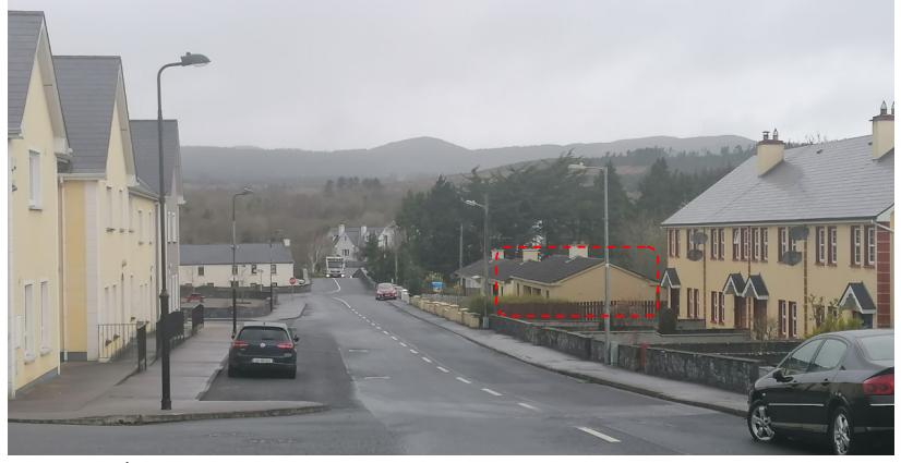
Green Road Streetscape view indicating Bungalow units 1 and 2 proposed for demolition and redevelopment

It is proposed to widen the existing public footpath as part of this redevelopment scheme.