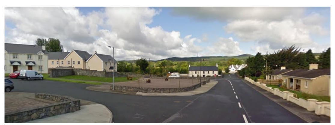
Fig 6 Existing streetscape view:

The context and provision of open space in the vicinity of the scheme in Coolaney is significant for this scheme. Directly opposite the proposed site there is a generous communal public open space comprising paved area and soft landscaping ( measuring a total of 1196 m<sup>2</sup> ). This provides a central meeting place and amenity space for the residents locally in the Green Road area of Coolaney.