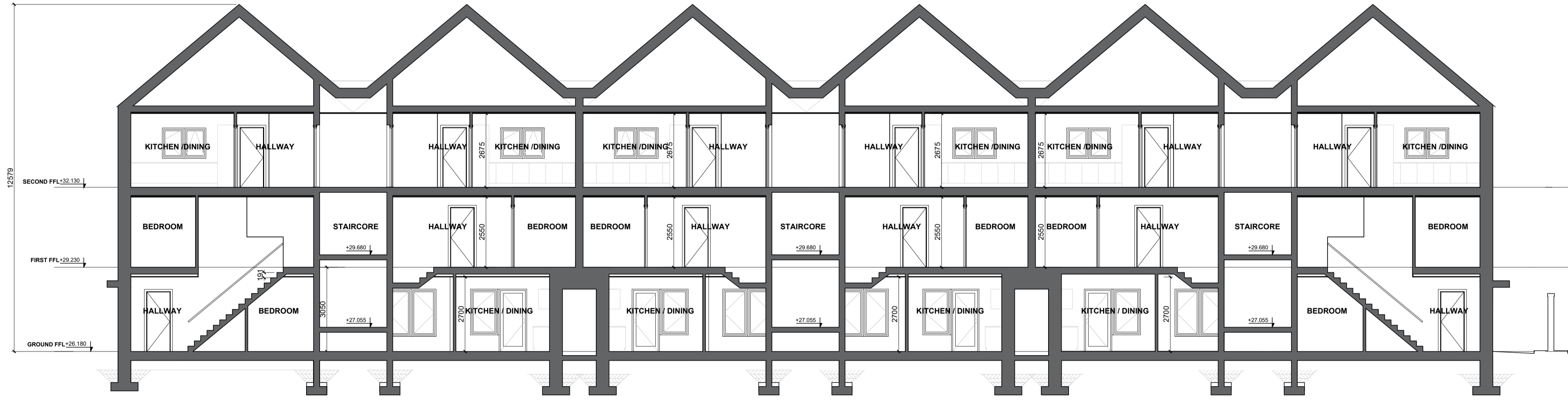
Section C-C (BLOCK C1) 1:100