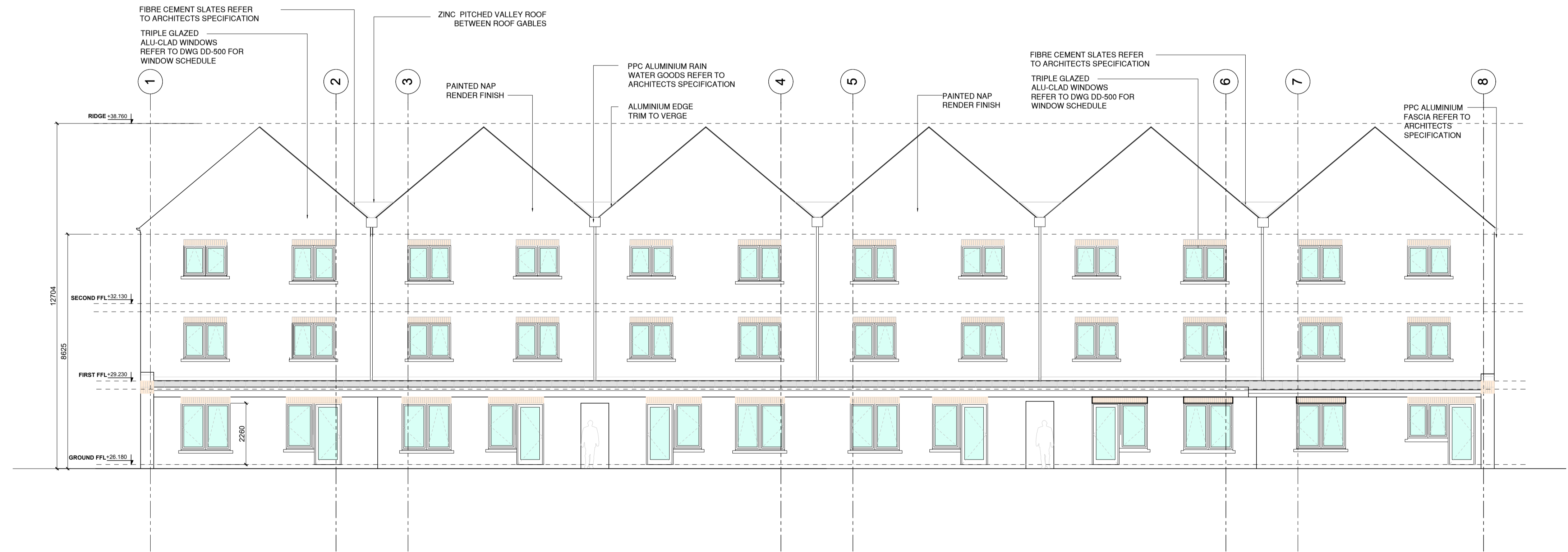
REAR (SOUTH) ELEVATION 1:100

DO NOT SCALE FROM THIS DRAWING. ALL FIGURED DIMENSIONS ARE TO BE CHECKED ON SITE. ANY ERRORS OR OMISSIONS ARE TO BE IMMEDIATELY REPORTED TO THE SLIGO BOROUGH COUNCIL ARCHITECT OR REPRESENTATIVE. ALL CONSTRUCTION PRACTICES ARE TO CONFORM WITH CURRENT BUILDING REGULATIONS.