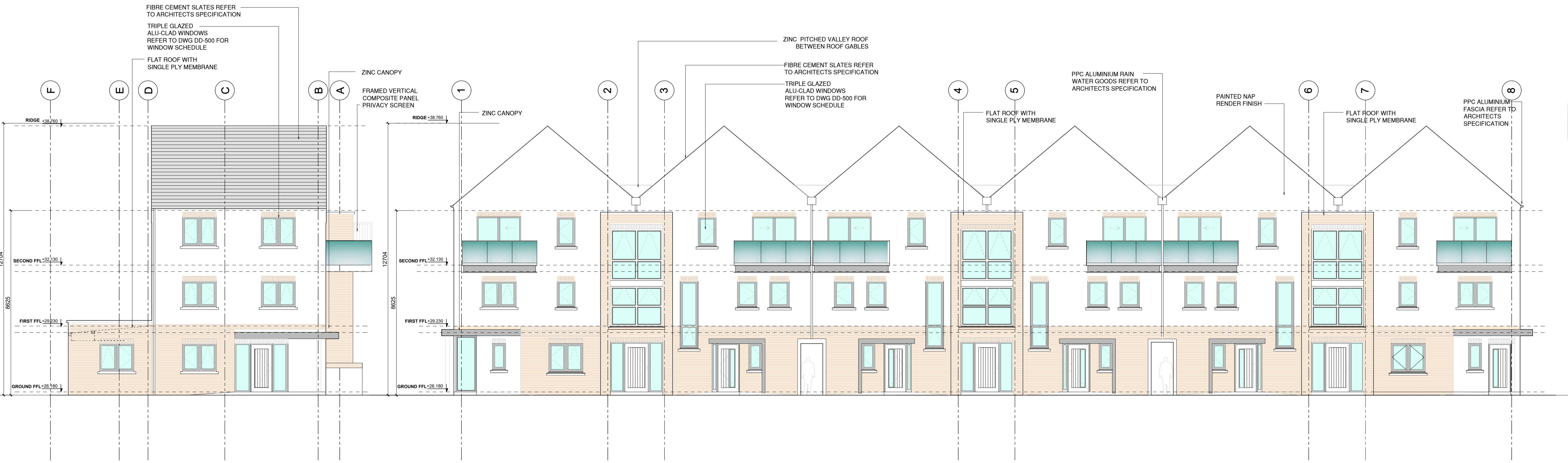
END ELEVATION - EAST (ROBBERS LANE) 1:100