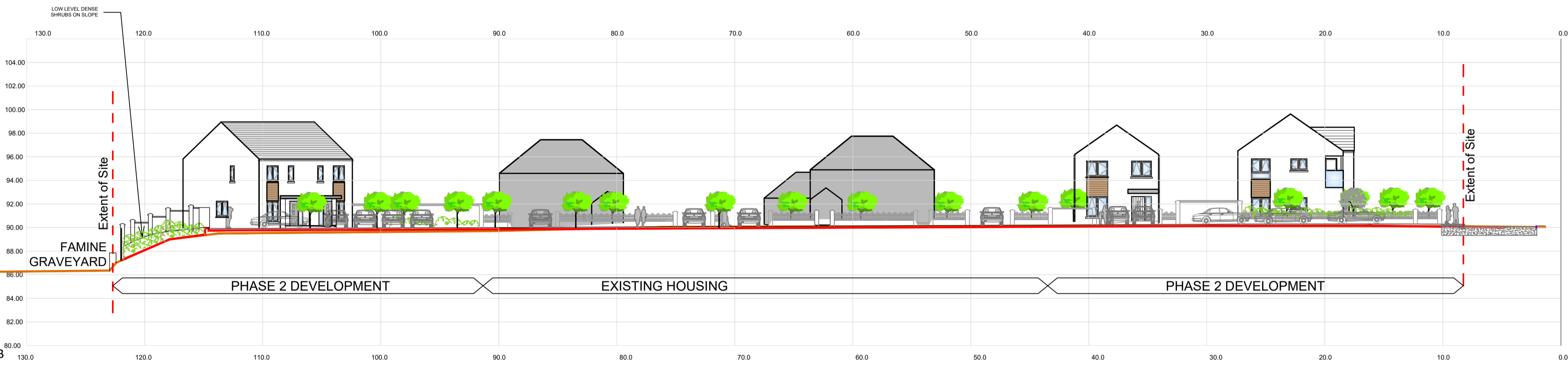
2 SITE SECTION B-B Scale: 1:250@A1