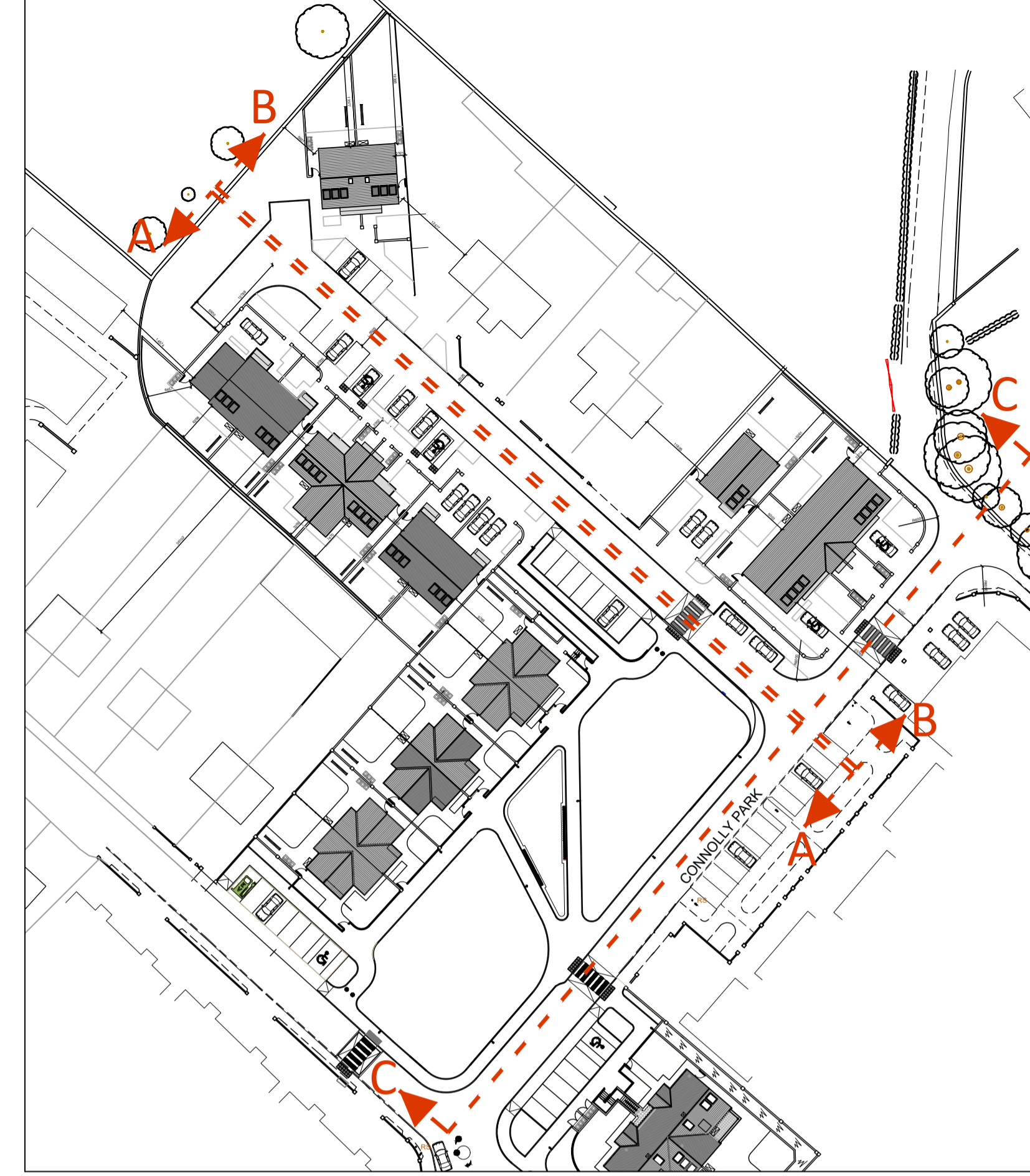
4 KEY Scale: NTS