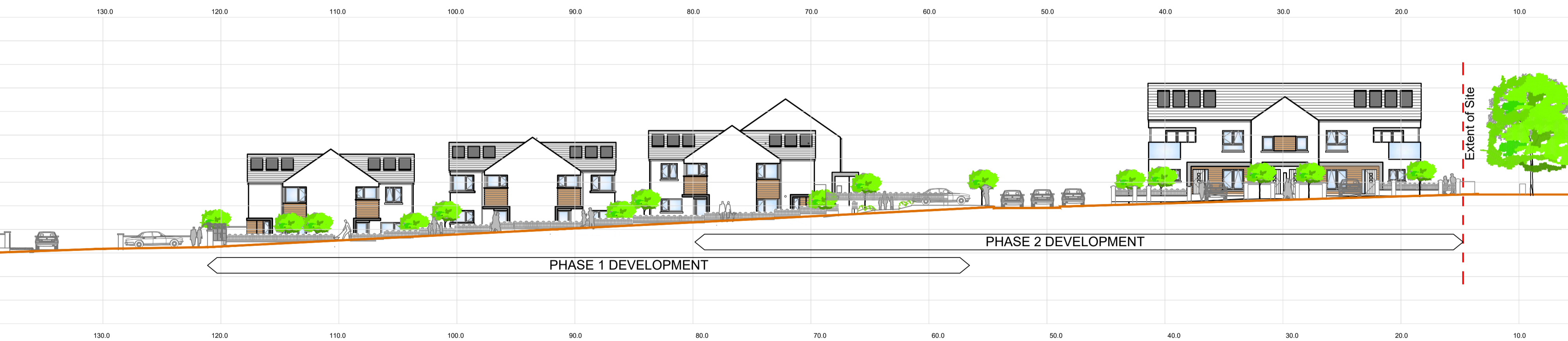
3 SITE SECTION C-C Scale: 1:250@A1