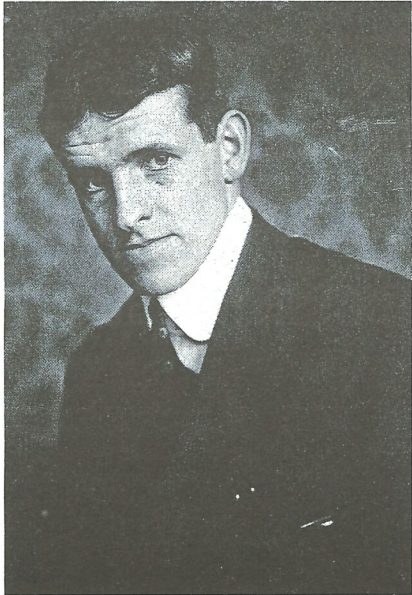
Jack B Yeats.

Jack Yeats remains one of Ireland's most accomplished and critically acclaimed artists. Much of his work is deeply influenced by the people and landscape of his beloved Sligo. Jack lived for most of his youth with his maternal grandparents in the town, and cut his creative teeth on this experience of Irish life. The western characters he encountered in Sligo populated his works until the end of his life. While his subject matter remained the same throughout his