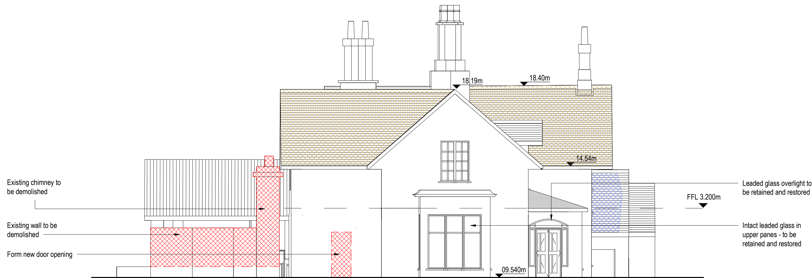
3 Existing-East-Elevation Rathellen House 1 : 100