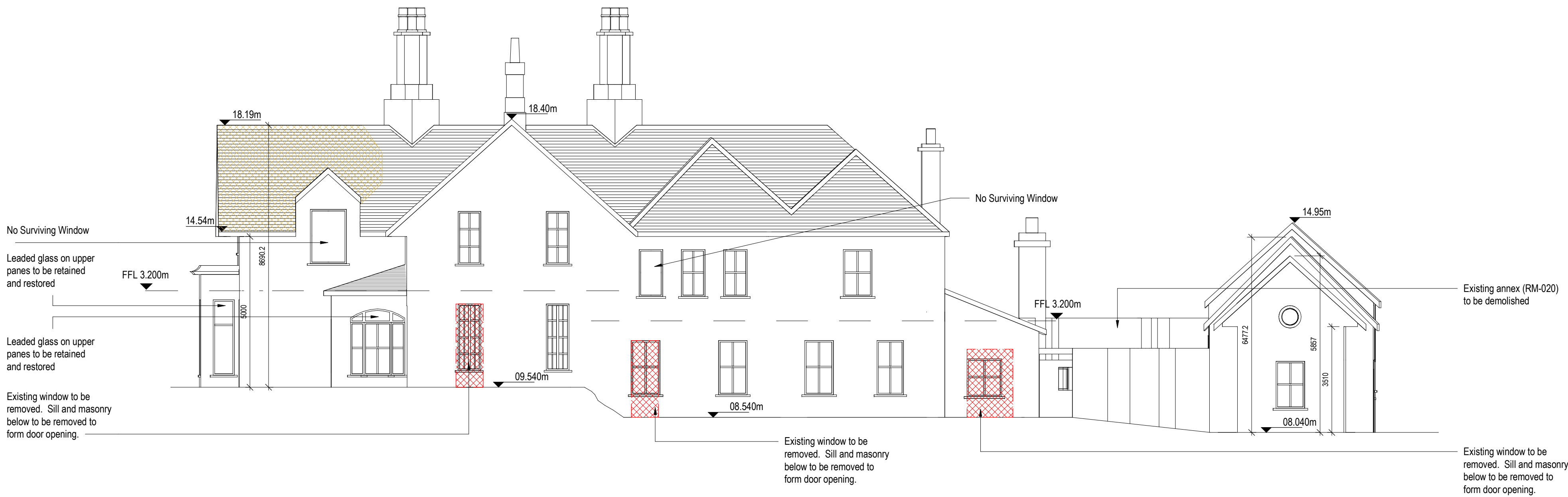
1 Existing-North-Elevation 1 : 100

Notes: Do not scale from this drawing. Use figured dimensions only. All errors and omissions to be reported to the Architect. This drawing to be read in conjunction with relevant consultant's drawings. All dimensions are in millimetres and all levels are in meters to match Datums unless otherwise noted. Contractor Design Responsibility It is noted that there are many elements within the works that require contractor design, and will be subject to certification as part of BCAR – see Preliminary Inspection Plan for clarity on certification required. © This drawing or design may not be reproduced without permission.