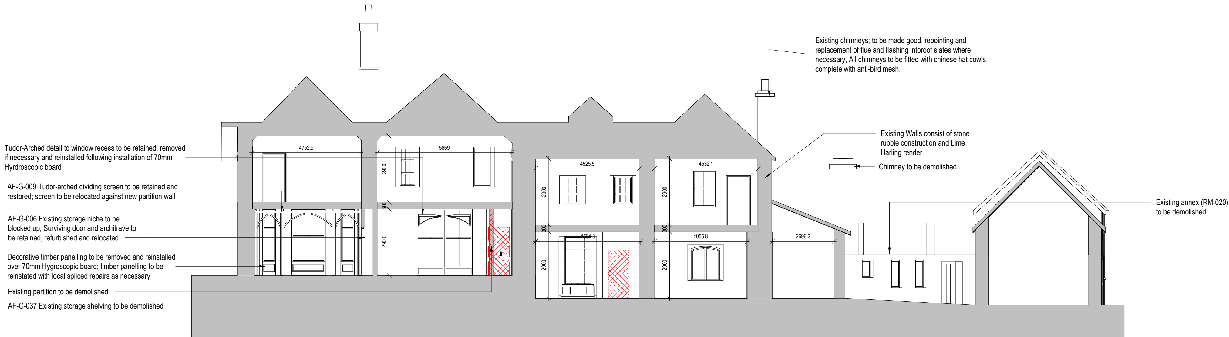
3 Existing Section A.A. 1 : 100