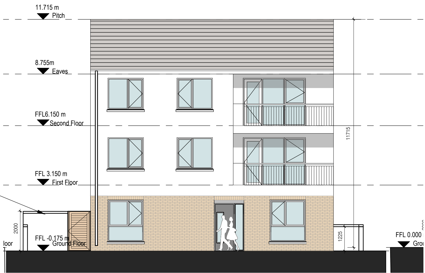
06 Side Elevation Scale: 1:100