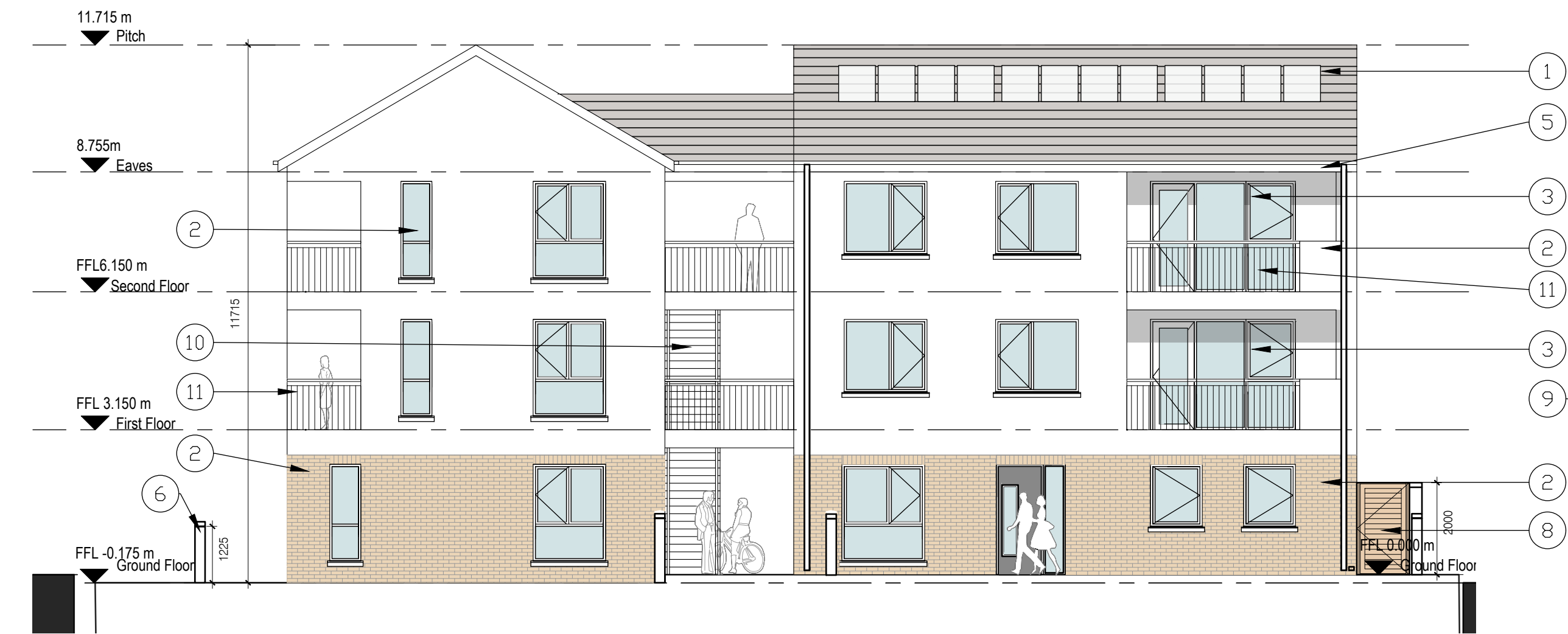
05 Front Elevation Scale: 1:100

Notes: Do not scale from this drawing. Use figured dimensions only. All errors and omissions to be reported to the Architect. This drawing to be read in conjunction with relevant consultant's drawings. All dimensions are in millimetres and all levels are in meters to match Datum unless otherwise noted. Contractor Design responsibility It is noted that there are many elements within the works that require contractor design, and will be subject to certification as part of BCAR - see Preliminary Inspection Plan for clarity on certification required. © This drawing or design may not be reproduced without permission.