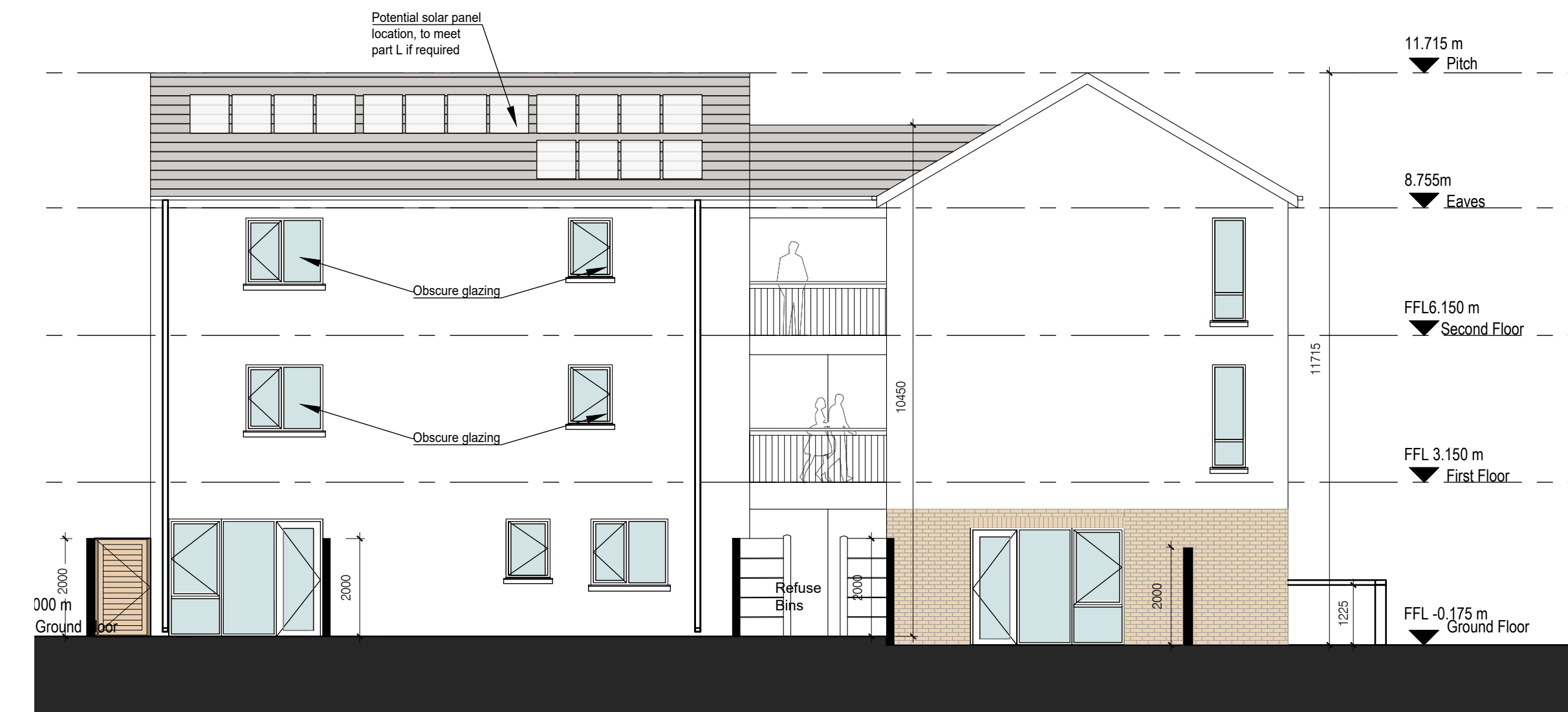
07 Rear Elevation Scale: 1:100