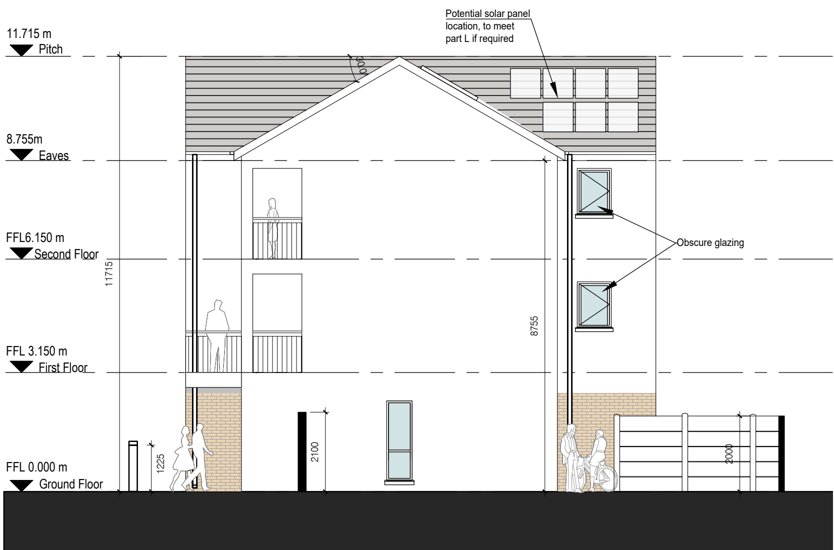
08 Sectional Elevation Scale: 1:100